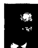
Chicago Mayor Richard Daley ALEC 25th Annual Meeting Host Committee Honorary Chairman

A real Chicago welcome is on hand with one of the nation's leading city chief executives and a leader of the business community.